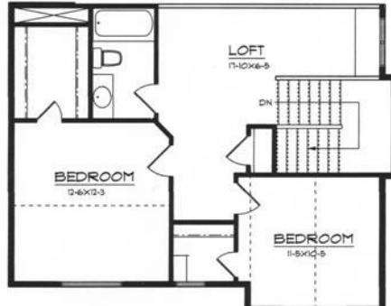
UPPER FLOOR PLAN 643 Fin&Aft