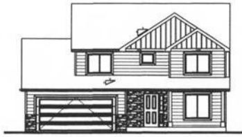
FRONT ELEVATION-B Scale 1/8"=1'-0"