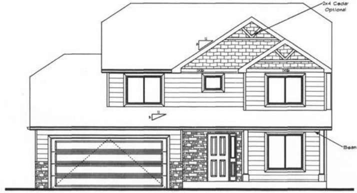
FRONT ELEVATION-A Scale 1/4"=1'-0"